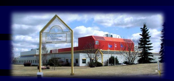
Food Processing Development Centre