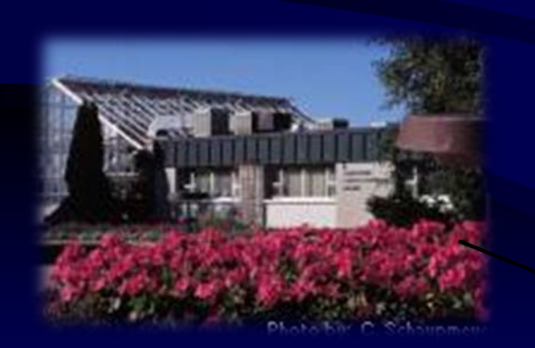
Food Science & Technology Centre